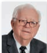
Eugene Braunwald, MD Keynote Speaker